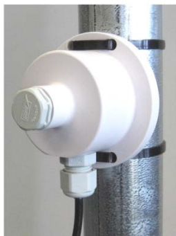
Figure 1: S-BPB Mounted to Tripod Mast

CAUTION: Do not screw the sensor to the side of the HOBO U30 case. Inserting screws in the side of the HOBO U30 case will violate the integrity of the unit. You can use double-sided tape.