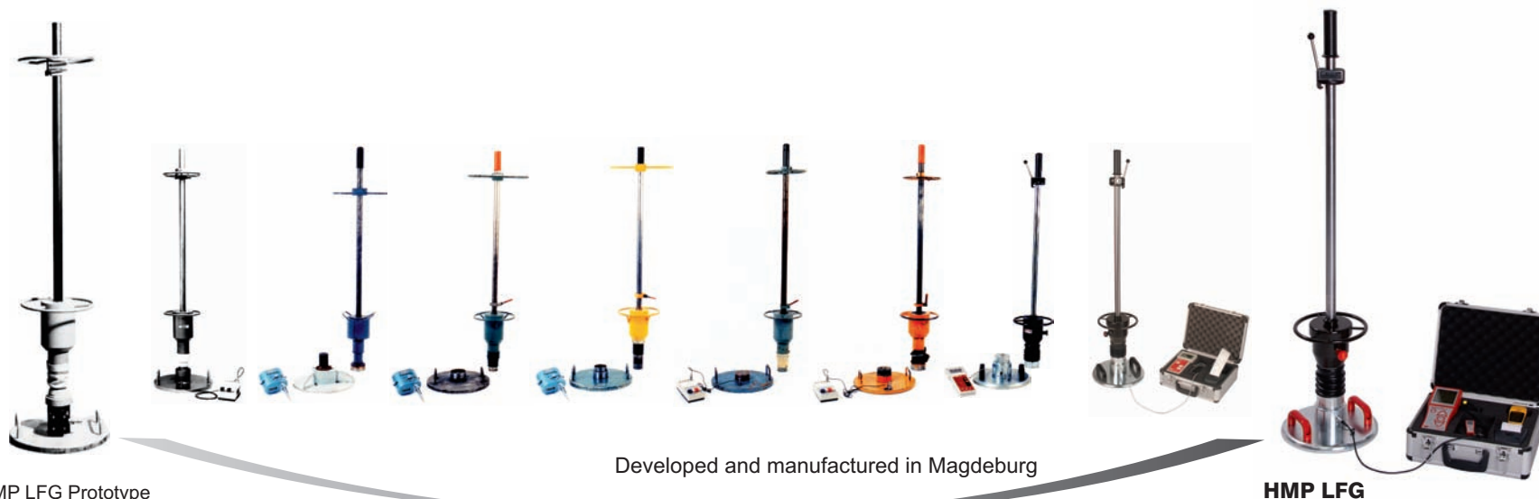
HMP LFG Prototype

30 years of experience and an independent service division with calibration institute ensure you an All-round service and an operational readiness of your device for years!